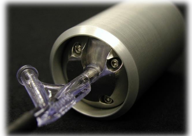
High Pressure Simpluer Model CHA connected to Y Luer loc (Female)

No flange - Use Model CCB Tube Grabber™ with 8.2 mm diameter seal or Model CAA for low pressure applications