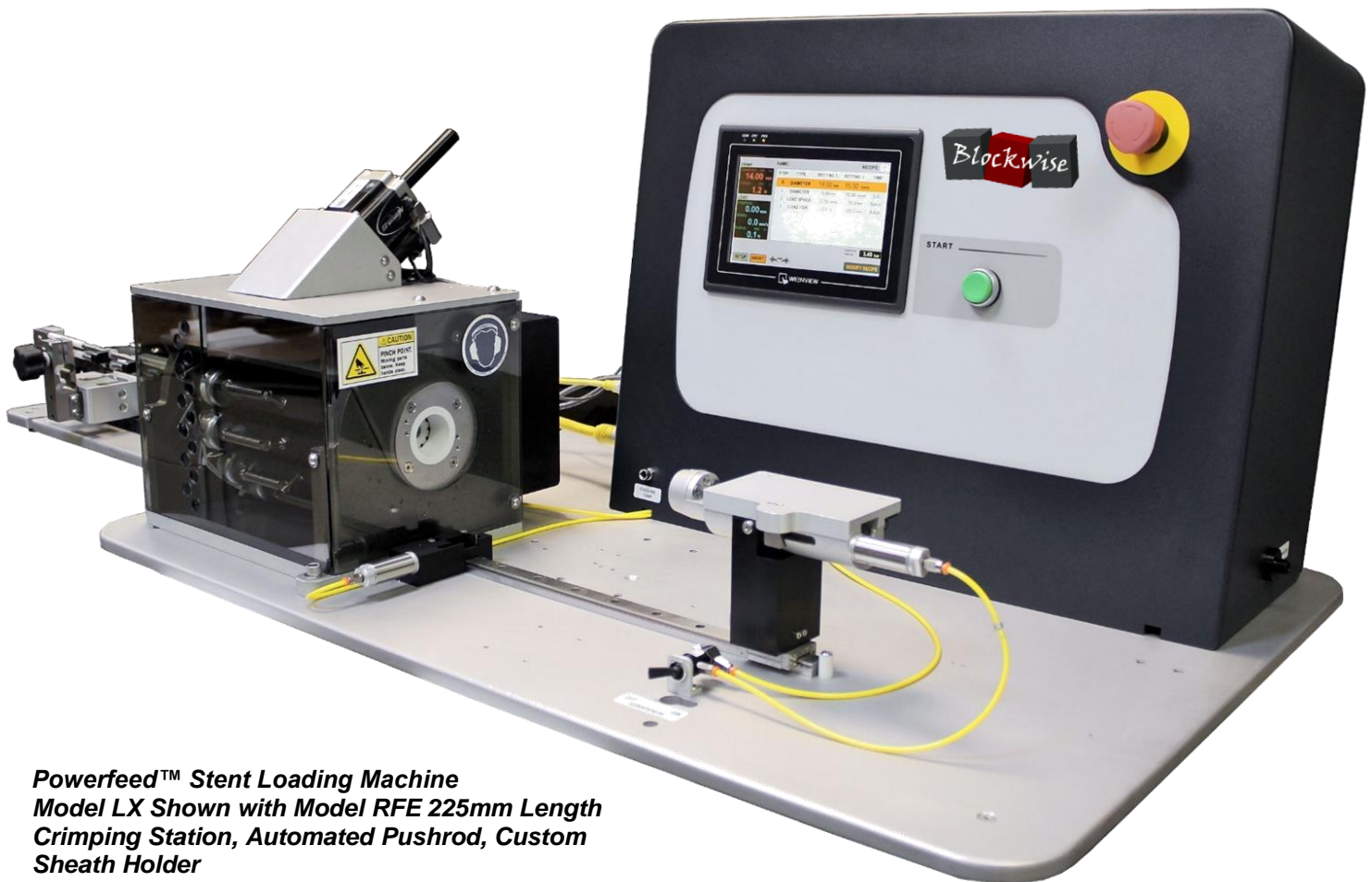
Powerfeed™ Stent Loading Machine Model LX Shown with Model RFE 225mm Length Crimping Station, Automated Pushrod, Custom Sheath Holder

Compression station includes the patent-pending Powerfeed™ technology in which the dies are actuated in an axis parallel to the stent loading path in such a way to propel the stent through the compression mechanism. The Powerfeed action and rate can be fine-tuned for the most delicate and difficult to load stents.