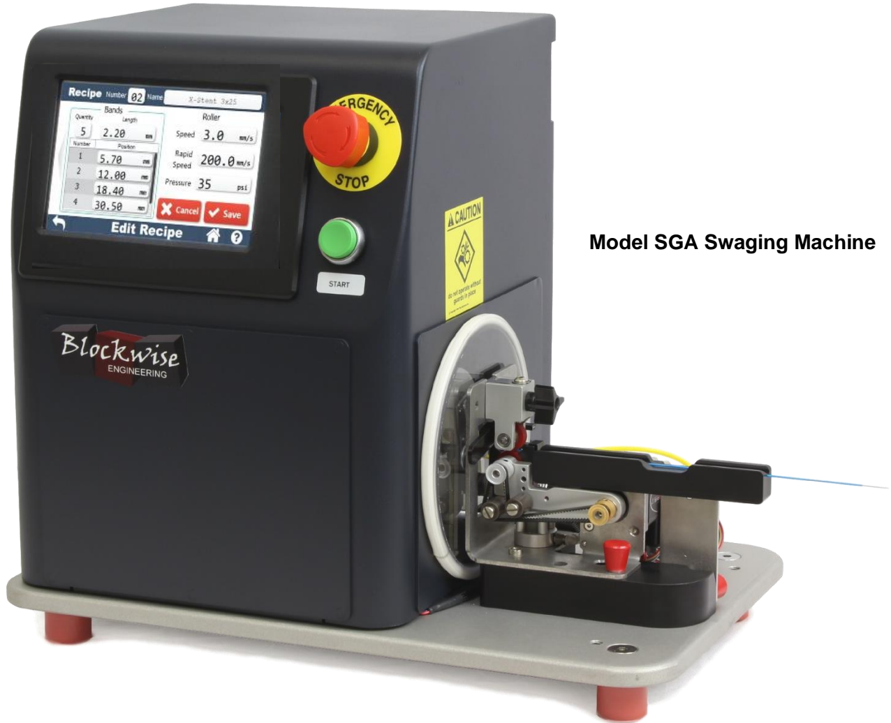
Model SGA Swaging Machine

Band swaging machine Models SGA (standard) & SGB (high-force) are designed to swage metal bands onto plastic tubes. Swaging is defined as making many small deformations to gradually reduce the diameter of the tube or band. The machine uses a rotating die with a round opening to reduce the diameter of the metal band while keeping it round with a fine surface finish. These machines do not position or pre-crimp the bands. Blockwise has both a. Model SGA (standard) is typically used for soft precious-metal radiopaque marker bands. Model SGB (high force) is typically used for strong stainless steel bands.