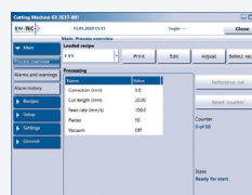
User Friendly BW-TEC HMI

The zip-bag collecting device collects the cut lengths directly in the zip bag, which enables fast and clean packing.