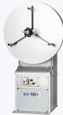
Adjustable Spool Fixture