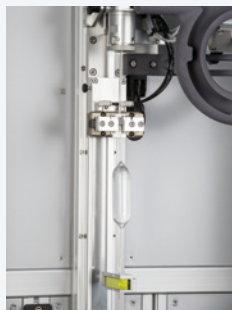
Product Guidance Balloon