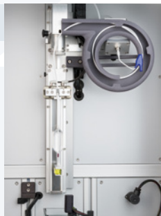
Product Guidance Catheter

Inflation and deflation measurement: cycle measurement filling and emptying of the product