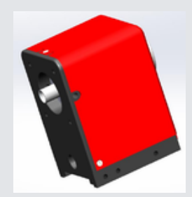
Figure 6 Direct drive spindle