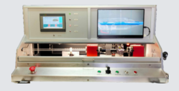
Figure 1LBS6000 Balloon Catheter Laser Bonder