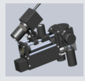
Figure 2 Programmable Spot Beam Delivery System